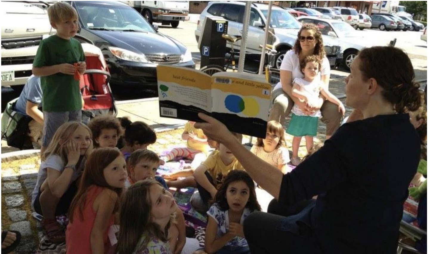
Storytime at the Union Square Farmers Market