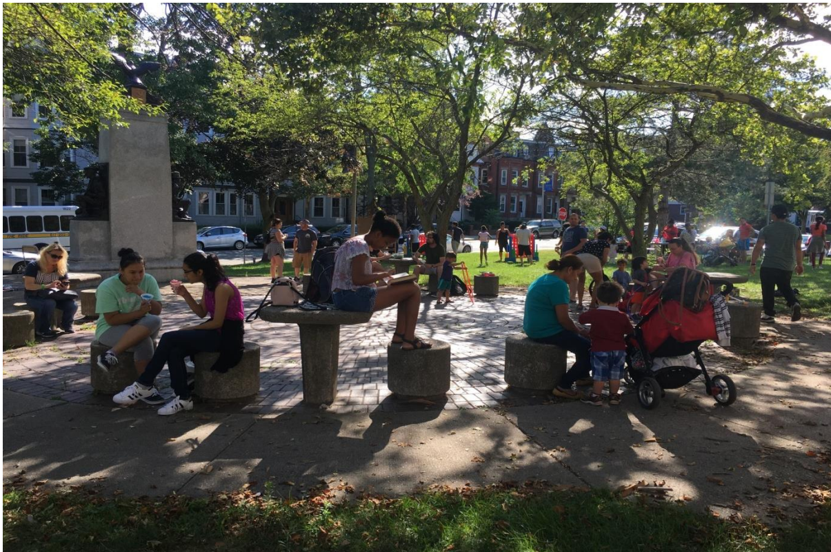
Summer Jam on the front lawn of the Central Library, 2017

The Somerville Public Library enhances the Somerville experience by acting as a trusted community connector, providing cultural and learning opportunities to all.