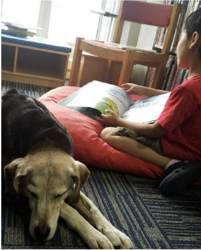
Child reading to a therapy dog at the East Branch Library