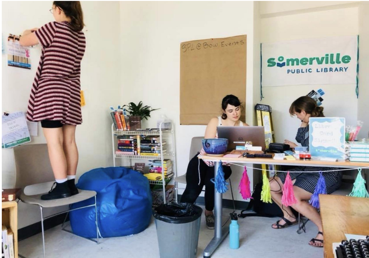
Library staff setting up pop-up library at Bow Market, August 2018