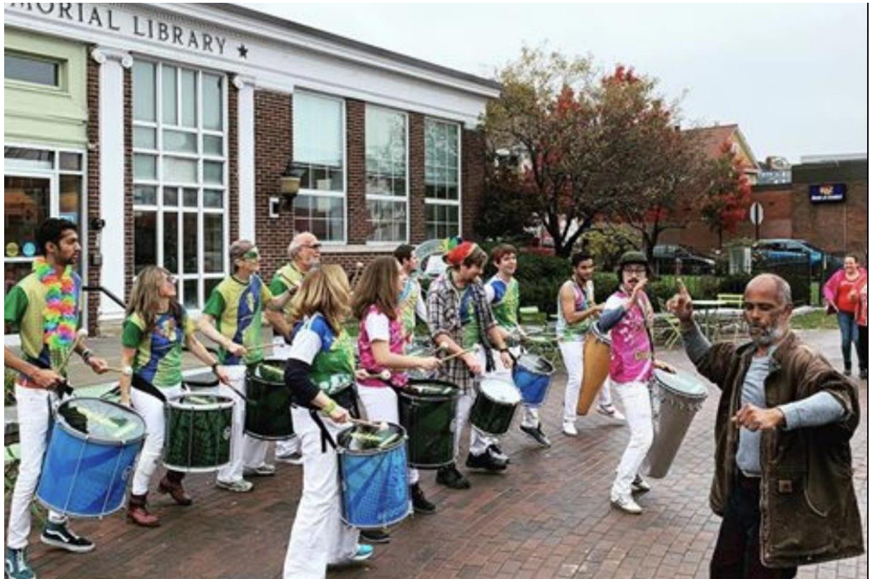
Performance by Grooversity at the East Branch Library, October 2018